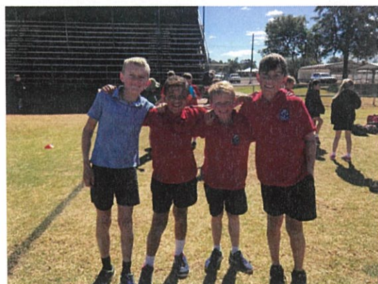
Junior Boys Relay