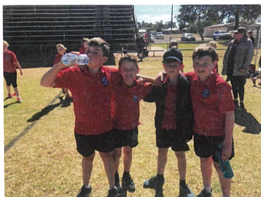
Senior Boys Relay