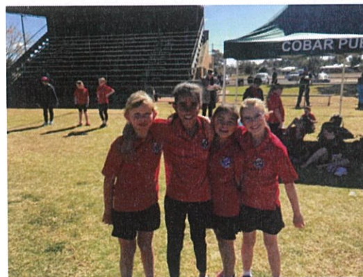
Junior Girls Relay