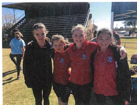
Senior Girls Relay