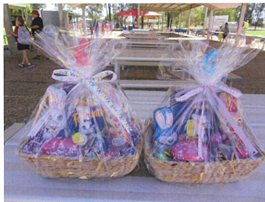
2 of the many chocolate baskets you might win on the chocolate wheel.