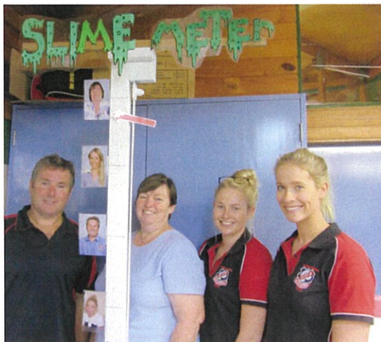
We will see if they are still smiling after they get slimed tonight.