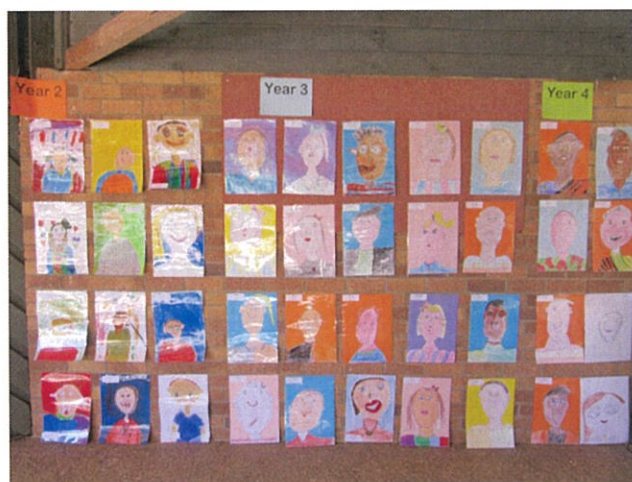
All students have drawn their portrait for you to purchase.