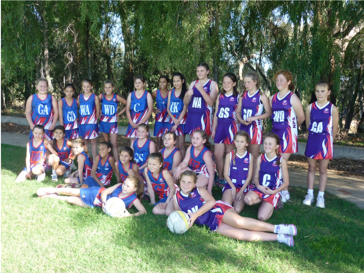
Waiting to start the day!

On Thursday 19 th May, 2016 Nyngan Public School attended the Coonamble Gala Day. We headed off in the dark, and returned in the dark!